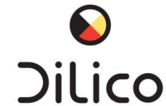
Anishinabek Family Care