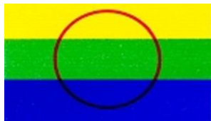
Peguis First Nation